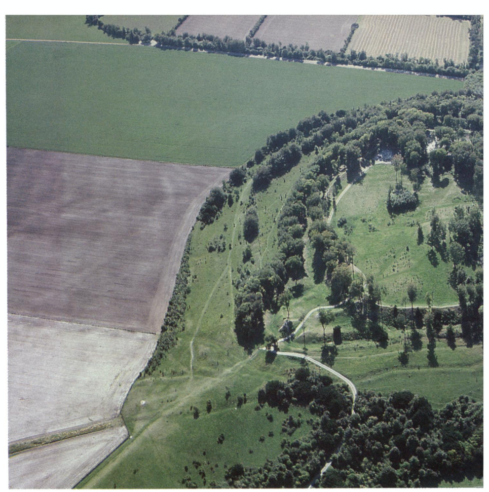
An aerial view of the massive Danebury hill-fort where some 2,000 "special burial deposits" have been unearthed.

The principle behind the use of these storage pits was quite simple. The