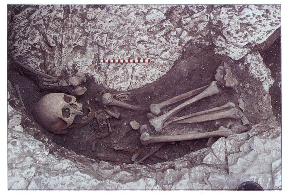
Danebury's pit-cemeteries also contained complete human skeletons, as well as pots, tools and horse gear.

The work of the last 20 years can fairly be said to have revolutionized our ideas on Iron Age death ritual. What emerges most clearly are three very different zones of belief: the southwestern and the northeastern zones, both adopting inhumation as the norm and both sharing much in common with adjacent parts of Europe; and a central